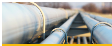
Chemical process tankage and pipelines